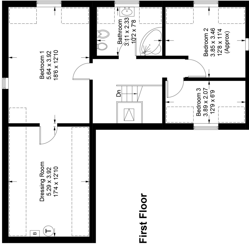
Illustration for identification purposes only, measurements are approximate, not to scale. (ID1113812)