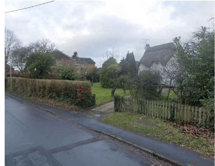
Fig.3 – Site access