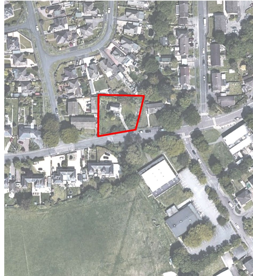
Fig.1 – Satellite view of the site