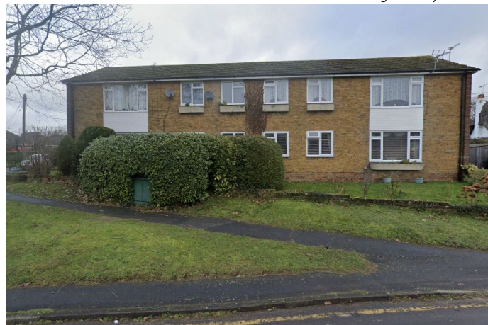
Fig.4 – Buildings to the west