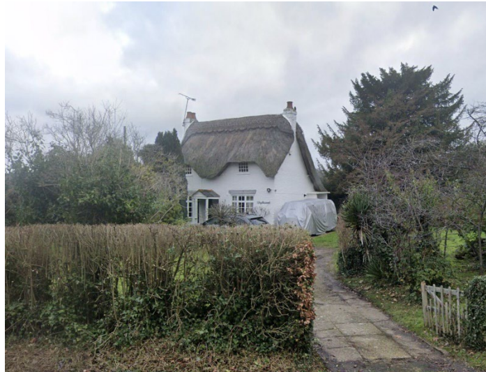
Fig.2 – Wychwood