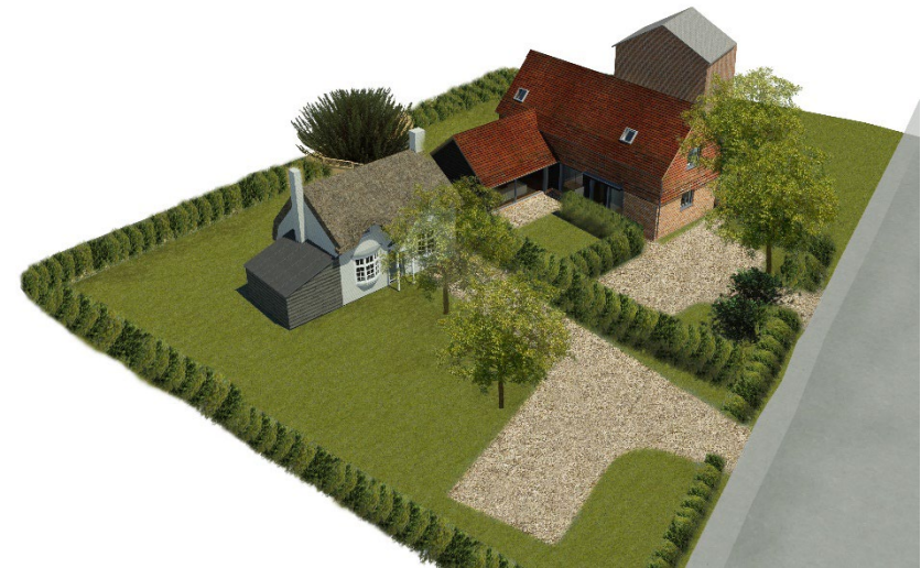
Fig.6 – Aerial view of proposed house, cottage and dwelling beyond to the east