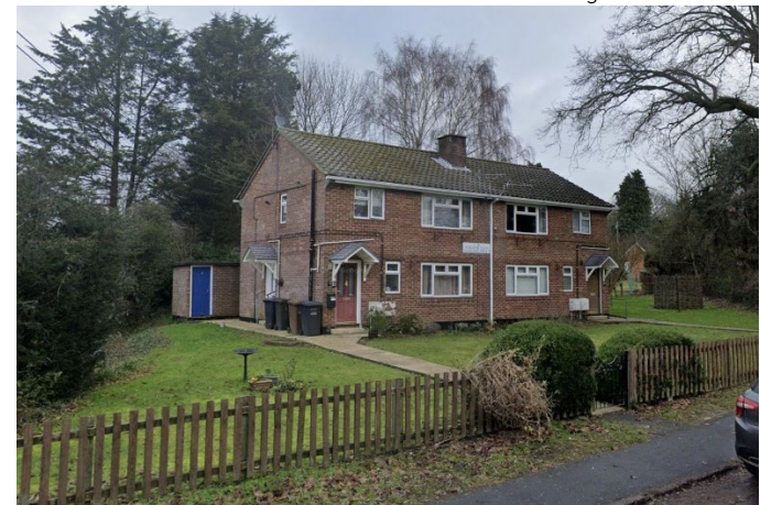
Fig.5 – Buildings to the east