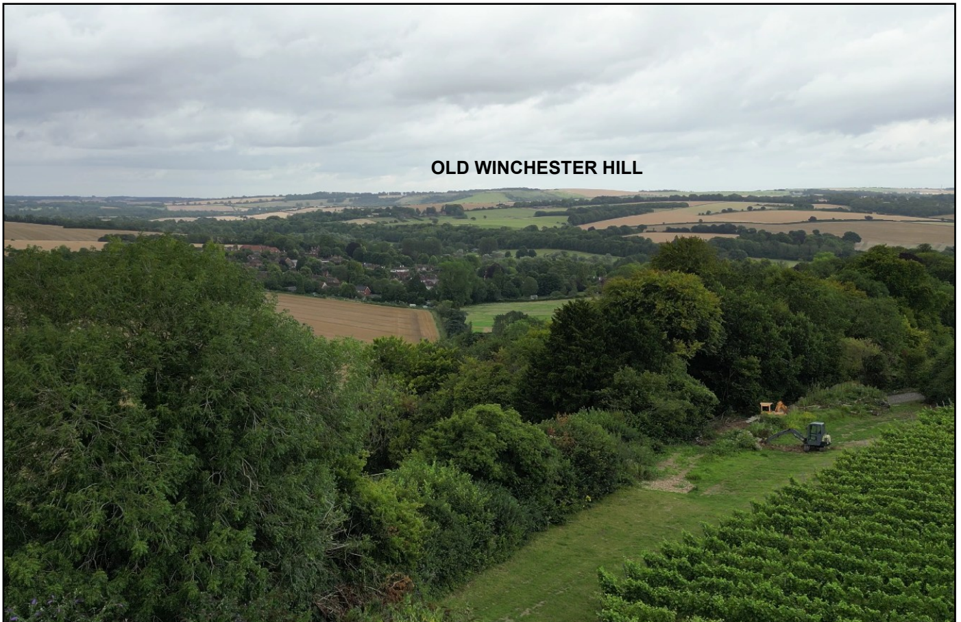
OLD WINCHESTER HILL