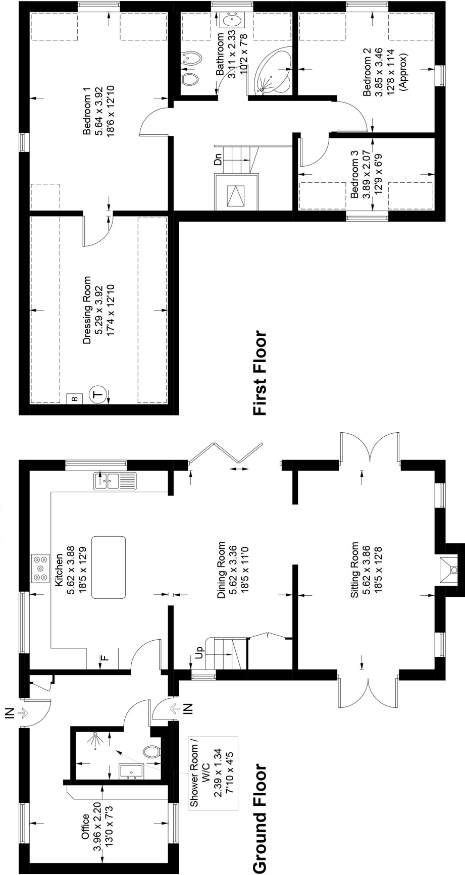
Illustration for identification purposes only, measurements are approximate, not to scale. (ID1113812)